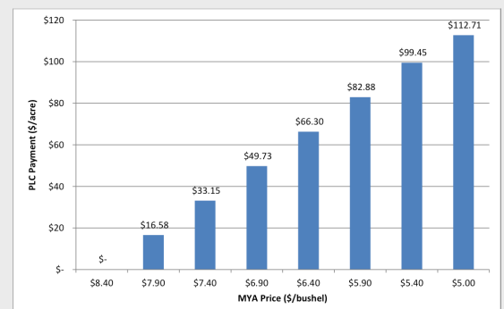
PLC Soybean Example +

+ These use a base yield of 6,300 lbs/ac (rice), 39 bu/ac (soybeans), and 133 bu/ac (corn). The values shown are payment estimates for a planted acre on an eligible base acre. Your values would change depending on your farm's base yield.